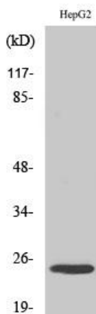
Western Blot analysis of various cells using MaxiK \beta Polyclonal Antibody